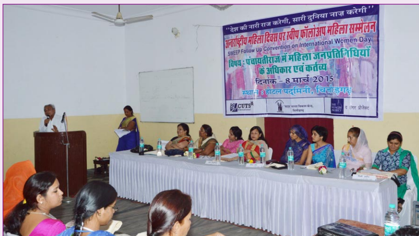
A woman is the epitome of tenderness, care and wisdom

Realising the fact that there is no tool for development more effective than the empowerment of women, the newly elected women representatives of Panchayati Raj celebrated the International Women's Day in Chittorgarh on March 08, 2015. The event was organised by CUTS CHD, under 'Strengthening Women Empowerment through Electoral Process (SWEEP)' follow-up convention supported by 'The Hunger Project'. This was the first time when all the newly elected women gathered under one roof to share their experiences related to Panchayat elections. To celebrate this significant convention, more than 225 people were part of the programme comprising women Sarpanch, Wardpanch, members of Panchayat Samitis from Chittorgarh, Nimbhera and Suwana blocks.